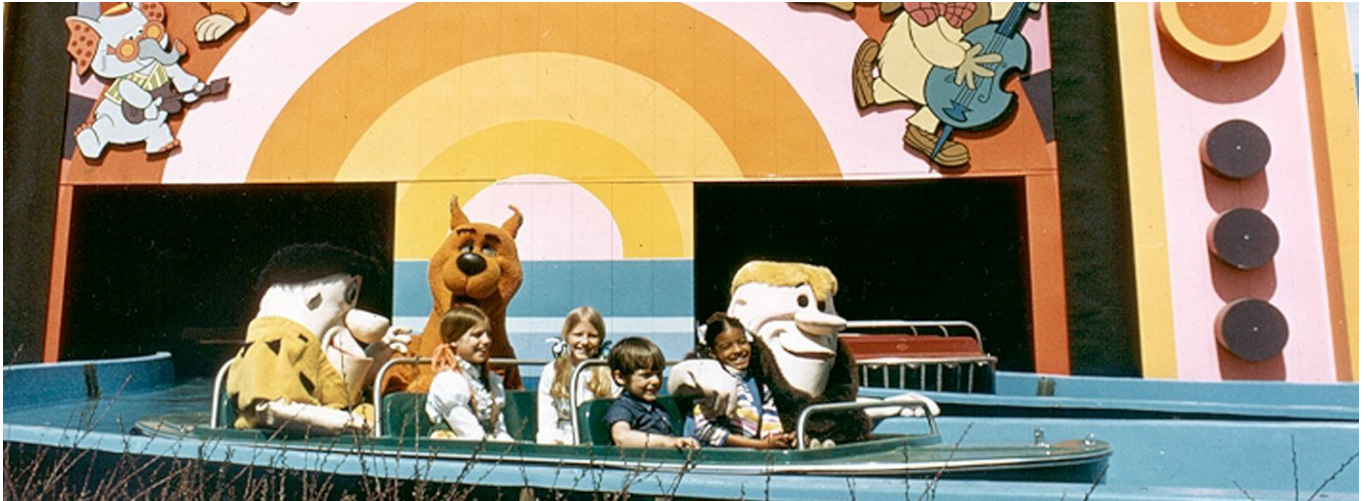
Above: Characters such as Scooby-Doo, Fred and Barney, and more could be found within the attraction.

The entire experience was as corny and over-the-top as it sounded. By 1983, the ride was in dire need of a refurbishment, as many of the animatronics and effects were starting to go bad. It was the 1970s after all, and most theme parks, especially growing ones like Kings Island, had yet to grasp the “Disney standard” concept of constantly maintaining and refurbishing attractions. Rather than invest money in repairing a quickly-aging boat ride, Kings Island already had plans in the works for what was going to replace the slowly-dying Enchanted Voyage.