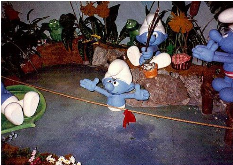
Left: The Smurfs have taken over the Enchanted Voyage during the 1984 overlay.

With 1980s television introducing many new cartoons, the popularity of the Smurfs was at its high point. The 1983 season marked the end of the Enchanted Voyage, and in 1984, a heavy retheming of the ride transformed it into “Smurfs’ Enchanted Voyage”. The new ride utilized the exact same layout as the Enchanted Voyage, but new animatronic figures and special effects were added in order to effectively recreate scenes from the popular Smurfs cartoon. The annoying theme song was also removed; yet somehow, the park managed to find a way to replace it with a song that was just as equally irritating (Yes, that song). It should be noted that the 1980s marked the unofficial Smurf takeover of Kings Island. During this decade, characters such as Papa Smurf and Smurfette roamed the park and the “Smurf blue” ice cream was introduced- a delicious blueberry-flavored treat that has since become a staple dessert of Kings Island. The new Smurf boat ride would not last long, however, and over the years the space once occupied by the Enchanted Voyage would become the home of several other dark ride attractions. But that’s a story for another time.